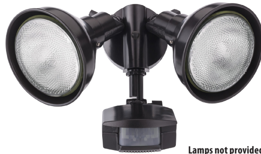
Lamps not provided.

Twin PAR Holder with Outdoor Motion Sensor