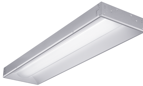
VT Series LED